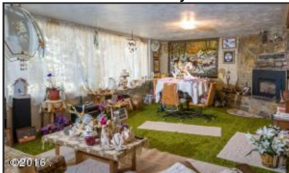
Downstairs Family Room