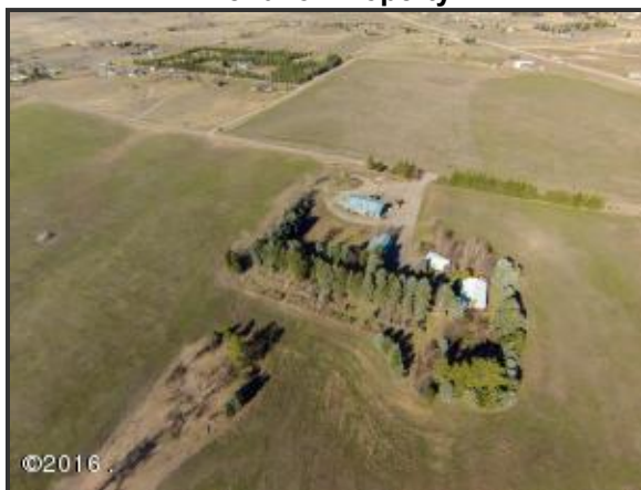
Aerial of Property