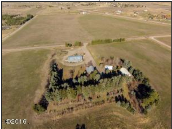
Aerial of Property2