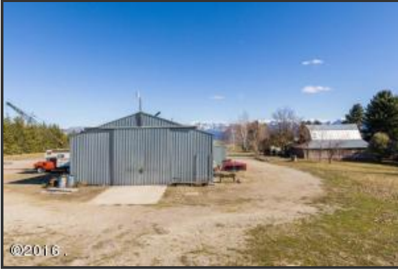
Shop & Barn