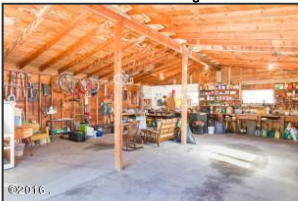
Interior of Garage