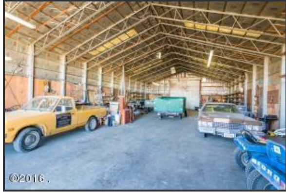
Interior of Shop