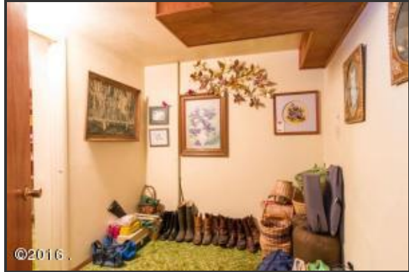
Storage Room just off Pantry