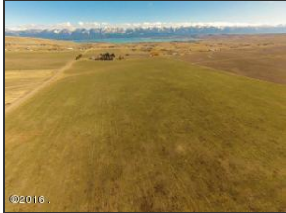
View from West2