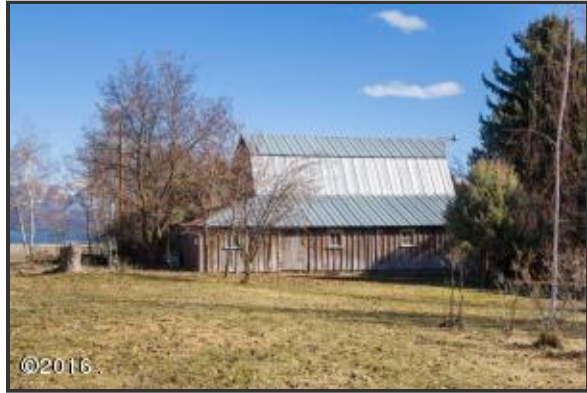
Barn built in 1920.