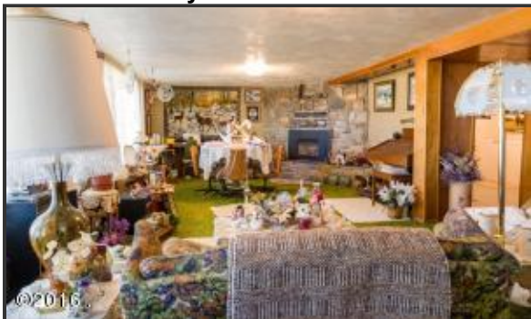
Family Room Downstairs