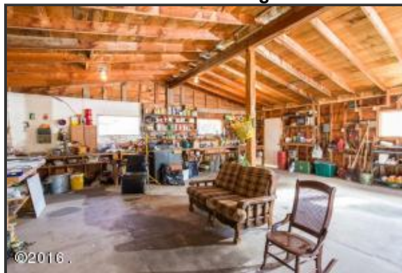
Interior of Garage2