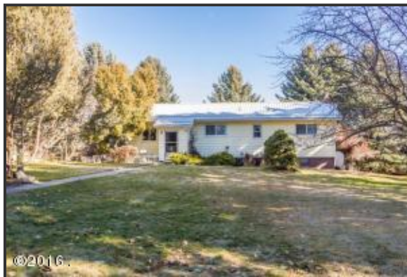
4 Bedroom House with Walkout Basement.