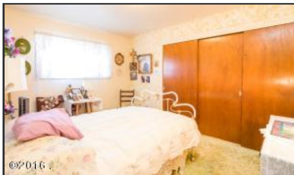
Main Floor Bedroom