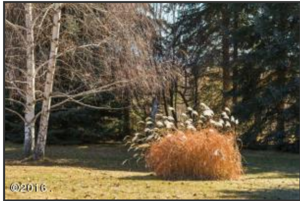
Tree Lined Yard for Windbreak