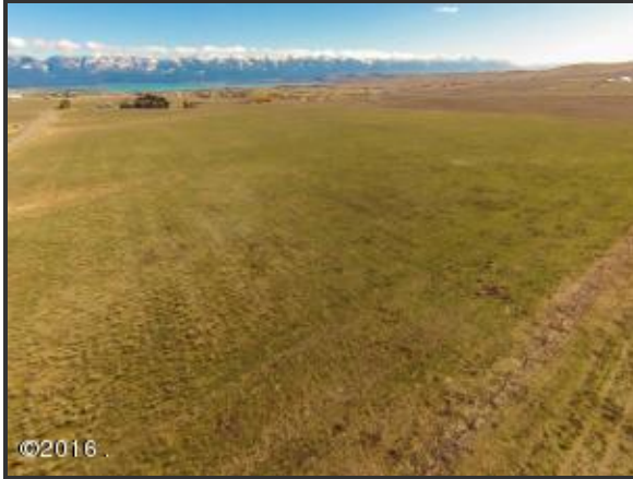
View from West