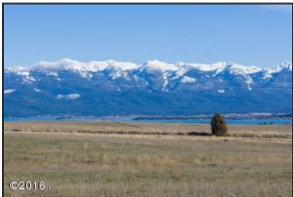
Beautiful Views of Mountains & Flathead Lake from this 80 Acres with 4 Bedroom House